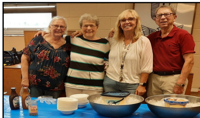
Serving at the Ice Cream Social for the Montessori students.