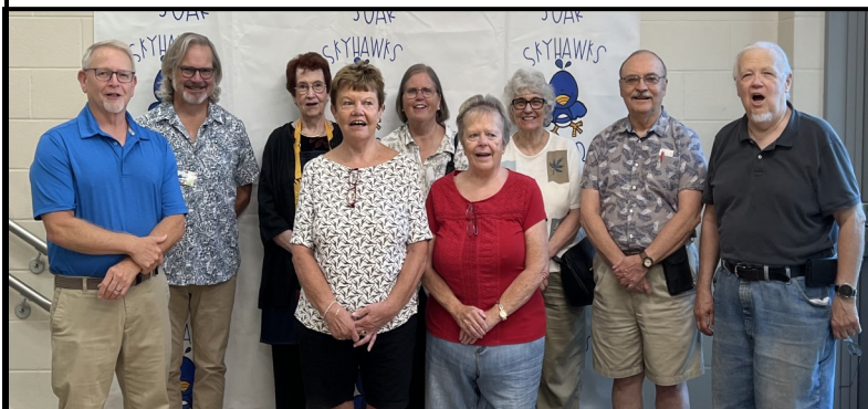
Helping Hands at Fairborn Primary helped students find their classrooms. Mitch and Troy helped too but were camera shy!